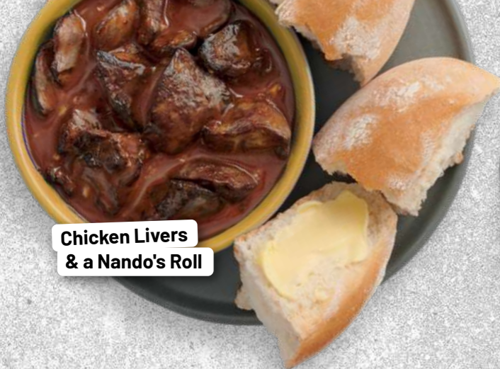
Chicken Livers & a Nando's Roll