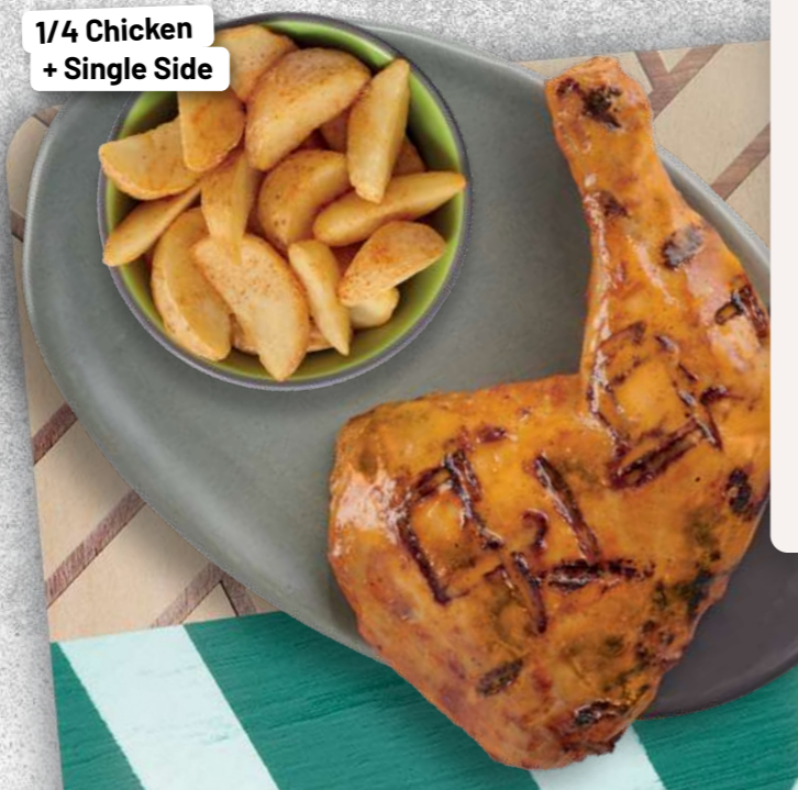
1/4 Chicken + Single Side