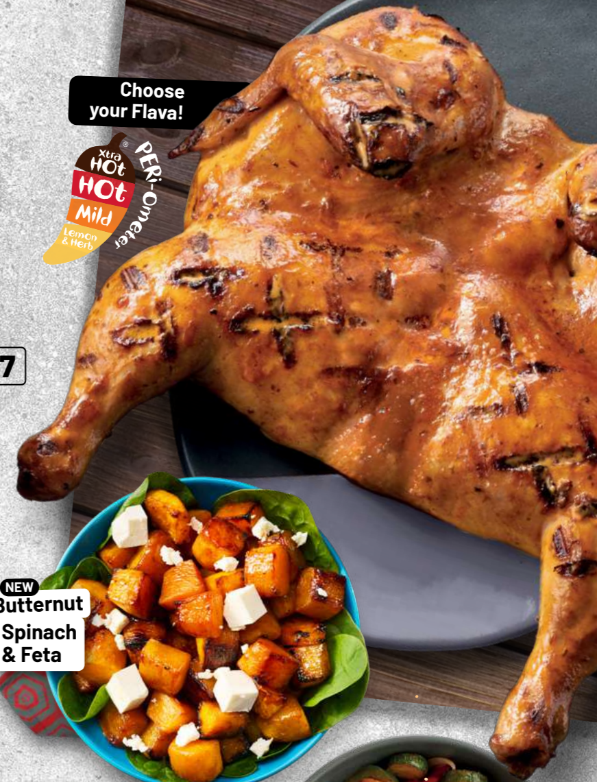
NEW Butternut Spinach & Feta